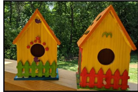
“Waiting For New Tenants”