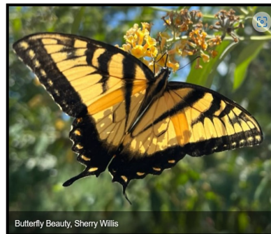
Butterfly Beauty, Sherry Willis

Photos included in the fall gallery submitted by Sherry Willis