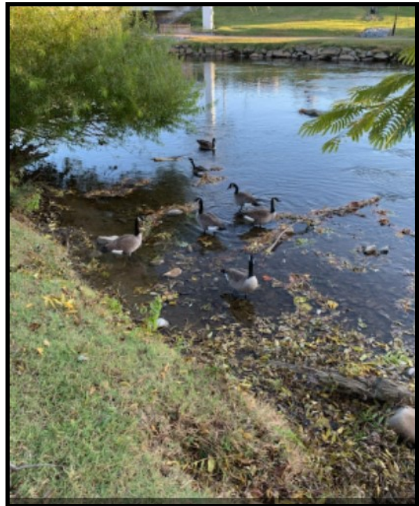
Above: “Down At the River”

Two Alpha Nu members' photos are included in the DKG Spring Art Gallery.